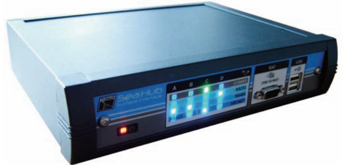
SeaHub (above) the USB successor to the SKIM-100 Interface Module (to the right)