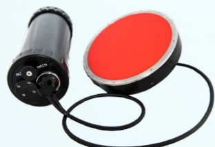
SeaKing Split Head Sub-Bottom Profiler