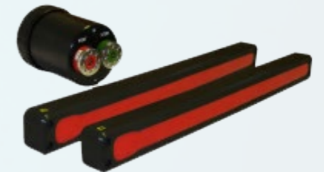
SeaKing AUV/ROV Sides Scan

Our SeaKing AUV/ROV Side Scan can be utilised for deep water survey where a towed system is not suitable. The system utilises DST technology and is extremely compact whilst remaining cost effective.