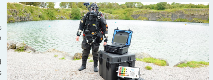
Diver Mounted Display

The system is available both Tethered (DMD-T) and Untethered (DMD-U) depending on the requirements of the diver. The DMD-T allows the topside dive team to see, in real time, what the diver can see while the DMD-U offers total diver freedom.