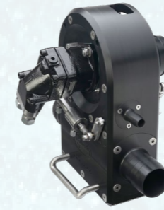
Super Zip Jet